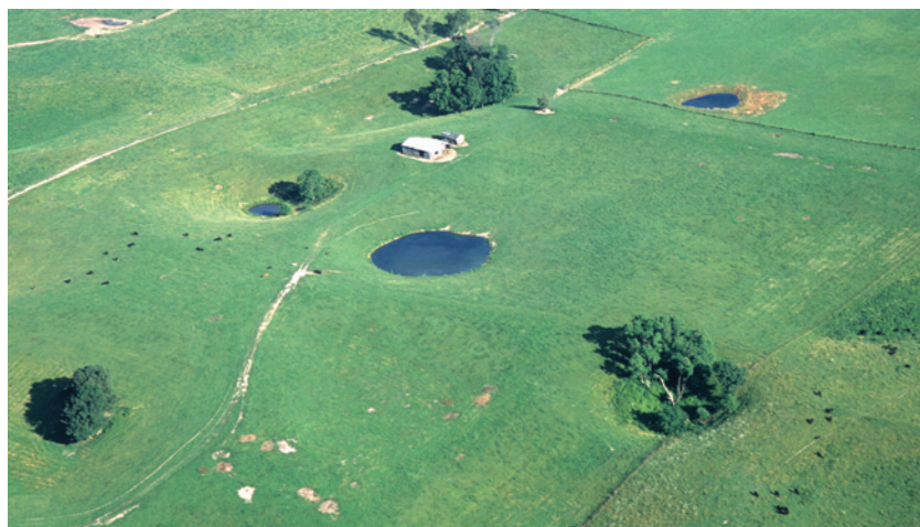
Fig. 8. Closely packed sinkholes cut in both the soil cover and the limestone bedrock of the Sinkhole Plain, near Mammoth Cave in Kentucky. Trees remain in the deeper sinkholes that have not been cleared, and ponds stand in sinkholes that are choked with soil. This terrain is now fairly stable as farmland, but new sinkholes would develop if the ground was disturbed by development.

the world that lie in a natural state. China's tiankengs have taken a million years to form, and even the thousands of shakeholes in the Yorkshire Dales karst have developed over the 12 000 years or so since the last Ice Age—at a mean event rate that is extremely low.