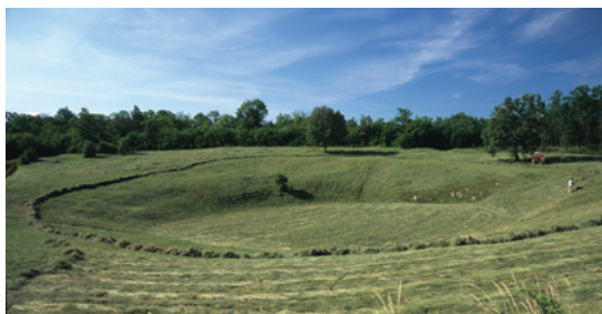
Fig. 1. A classic sinkhole in the Classical Karst of Istria, Slovenia, where it is known as a doline. Soil that has accumulated on the floor provides a patch of better farmland, and natural rainwater drainage is not causing ongoing subsidence.