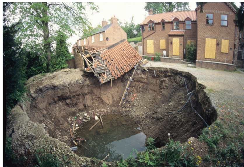
Fig. 4. A destructive sinkhole at Ripon in England’s Vale of York formed by the failure of soil and rock over a cave in gypsum.

Within the last 15 years or so, a variety of giant collapse sinkhole has been recognized, mainly in China, from where they therefore take their name—tiankengs, roughly meaning ‘sky holes’. These are defined as being at least 100 m wide and deep, though some are much larger than that (Fig. 3), and