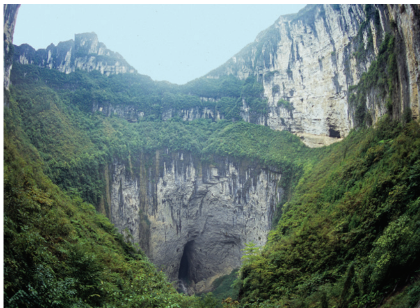
Fig. 3. Close to the Yangtze Gorges in the karst of southern China, the giant sinkhole of Xiaozhai Tiankeng is more than 600 m deep and wide. This viewpoint on the midway ledge is reached by a path with 1000 stone steps winding through the trees from the low point on the far rim. Reached by another flight of 1800 steps, the cave river is just visible emerging from a cave portal 100 m tall.