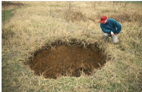
Fig. 6. A small new dropout sinkhole formed entirely in the soil cover over fissured chalk near Portsmouth.