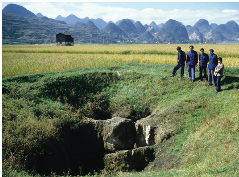
Fig. 10. One of 1200 new subsidence sinkholes that developed in the alluviated valley floor of Shuicheng, amid the splendid cone karst of Guizhou, China. This one was only 100 m from the black pump house standing over the over-abstracted borehole that induced the sinkholes by lowered the local water table.

Water table decline can affect larger areas and induce great rushes of new sinkholes. The worst case