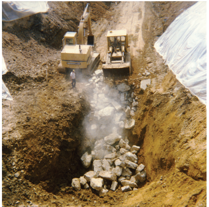
Fig. 12. Bulldozing chunk rock into the throat of a large subsidence sinkhole after it had collapsed to undermine a residential street in a small town in Pennsylvania (Photo: P. Dougherty).