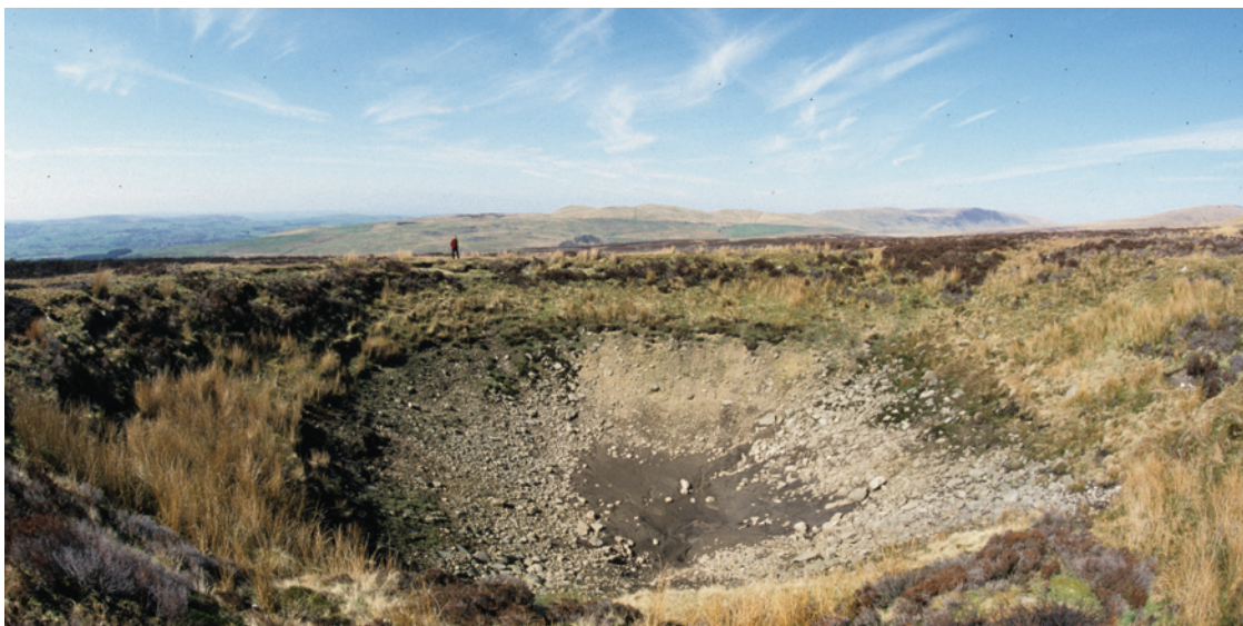
Fig. 7. A large subsidence sinkhole, known locally as a ‘shakehole’, in glacial till on a limestone hill in the Yorkshire Dales. At present, this one is well choked with soil, so it frequently fills with water after heavy rain.